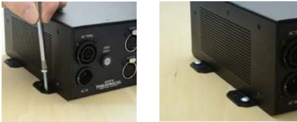
Figure 4: Surface Mount