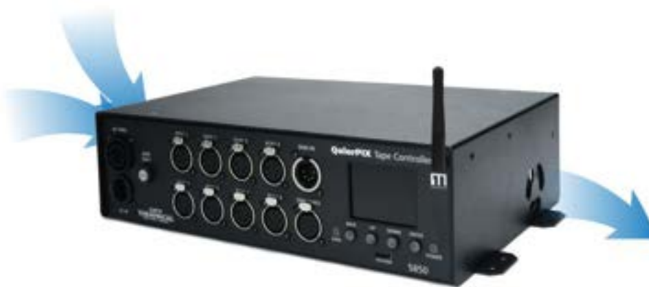
Figure 5: Air Flow