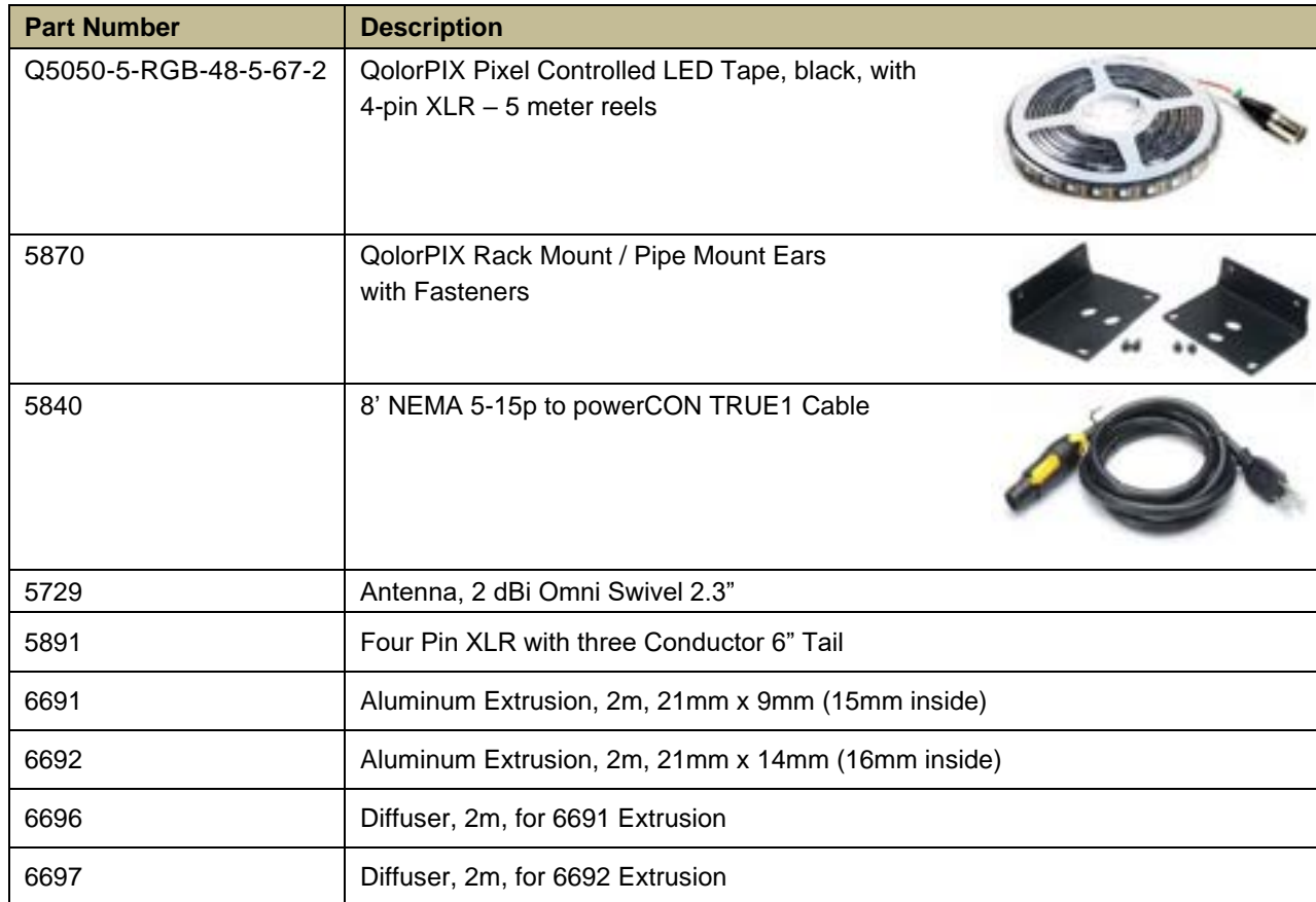
Table 5: Accessories