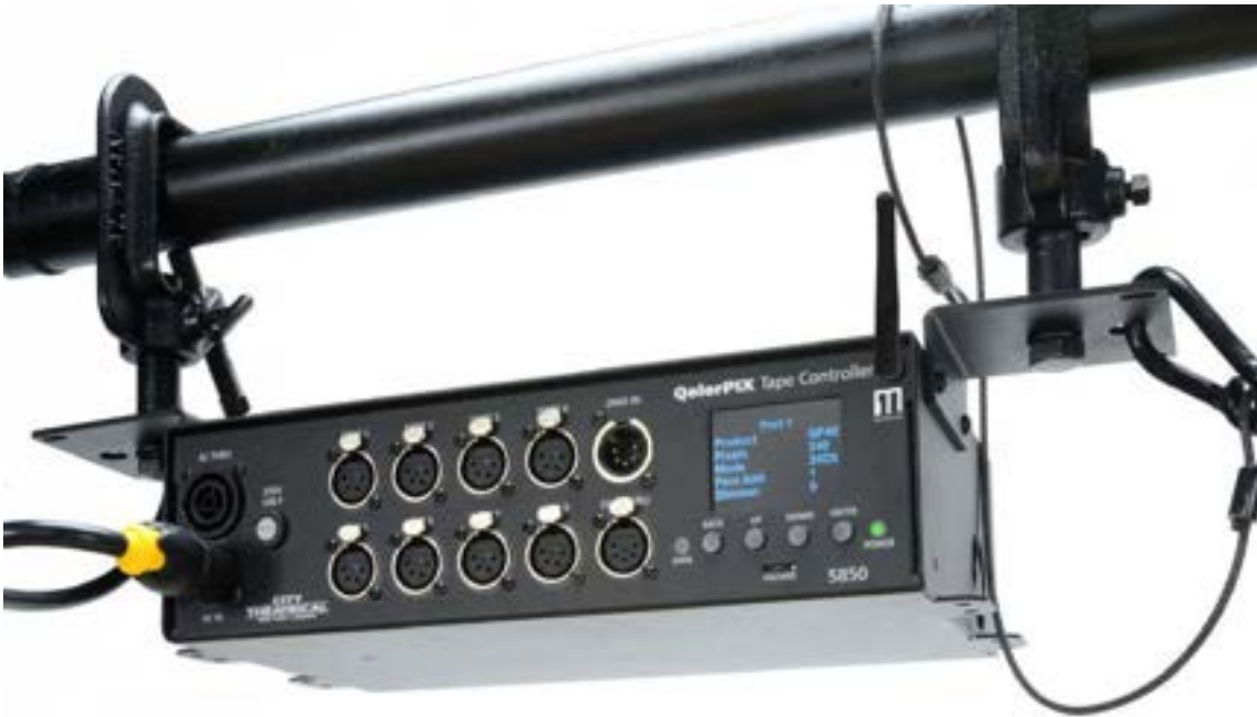
Figure 2: Pipe Mount