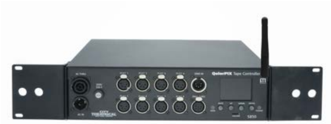
Figure 3: Rack Mount