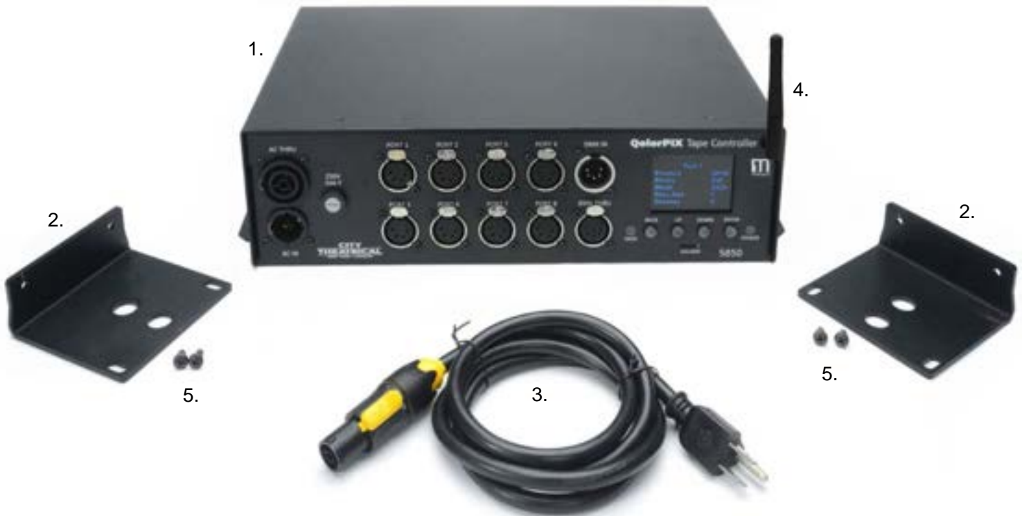
Figure 1: What's Included